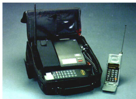
The CSD 9300 cellular system communicates securely with the CSD 4100 phone.