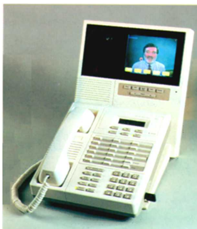
Secure color motion video conferencing with audio is possible at the desktop.

The Video Docking Unit (VDU) turns the CSD 4100 into a secure video telephone without requiring expensive dedicated transmission lines. When attached to the base of the CSD 4100 telephone, it can be used for secure point-to-point videoconferencing at the desktop. When connected to a scanner or external camera, it can transmit high-resolution images in still-frame mode. The images can even be