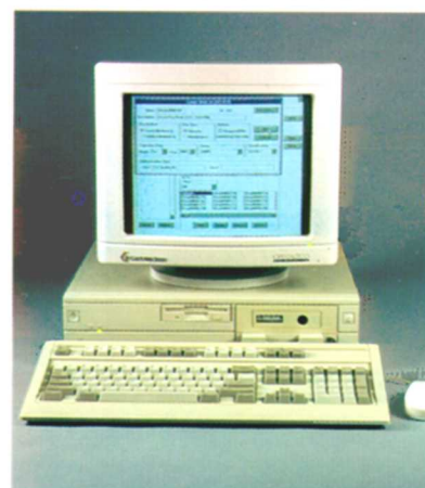
The KCA-4000 Windows-based system, centrally manages keys and access control.

The CSD 4100 is compatible with TCC's lightweight and full featured secure cellular telephone system - the CSD 9300. The same high level security is used in the CSD 9300 as in the CSD 4100 and CSD 3600. As a result, a mix of inter-operational security devices provide wired and wireless communications protection.