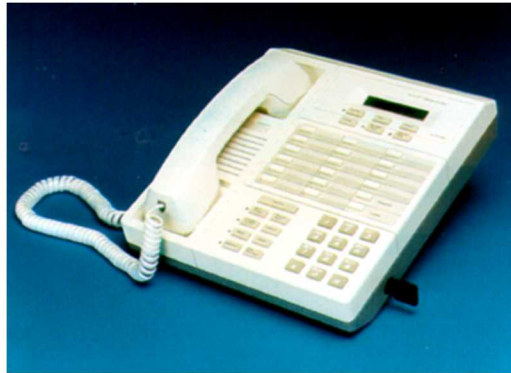
An authorized crypto ignition key is needed to communicate securely with the CSD 4100.

The CSD 4100 has a variety of security layers for optimum communications protection. A new key is negotiated each communications session using public key encryption, while TCC's private key system adds message authentication