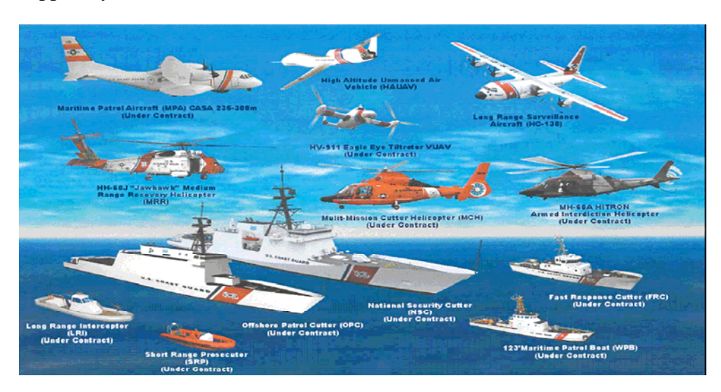
Figure 1: Ships and Aircraft Included in the Deepwater Program

existing assets with improved C4ISR equipment and innovative logistics support systems, too.