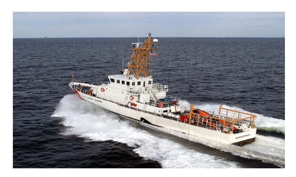
Figure 5: USCGC MATAGORDA, 123-Foot Patrol Boat

Because contractor trainers are not always knowledgeable or available to provide C4ISR guidance to crewmembers, Coast Guard officials sometimes must assume these responsibilities. One Coast Guard official has been assigned informally to provide hands-on C4ISR training on the 123-foot patrol boats as well as carry out his primary duties, which include program management, contract oversight, and system testing. Trainees also regularly call this individual directly to ask follow-on questions, instead of contacting Deepwater trainers. Trainees have found this individual to be more helpful than some contractors in providing guidance on how to apply C4ISR technology to Coast Guard missions and scenarios.