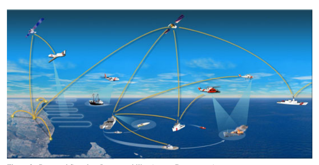
Figure 2: Proposed Seamless Interoperability Among Deepwater Assets

When Deepwater is fully implemented, the Coast Guard's assets will no longer operate as independent platforms with only limited awareness of their surroundings in the maritime domain. Instead, the assets will have improved capabilities to receive information from a wide array of mission-capable platforms and sensors. They will share a common operating picture as part of a network-centric force, operating in tandem with other cutters, boats, manned aircraft, and unmanned aerial vehicles. (See Figure 2.)