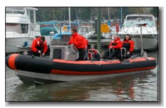
Figure 6: USCG Short Range Prosecutor

According to one captain, cutters spend an extensive amount of time in repair status. For example, although 123-foot patrol boats are supposed to be in operational status at least 2,500 hours each year, the boats generally spend about half the year undergoing repairs and therefore are unable to meet this expectation. Also, it is time-consuming for crews to remove parts from assets and mail them to the contractor facility for repair. Crewmembers stated that it might take several months to get the equipment back from the contractor. Without the full complement of C4ISR equipment while repairs are ongoing, crews find it difficult to operate the system as a whole. Officials at one operations center responsible for coordinating asset deployment often receive complaints about contractor delays in providing C4ISR support and repairs, but are powerless to help.